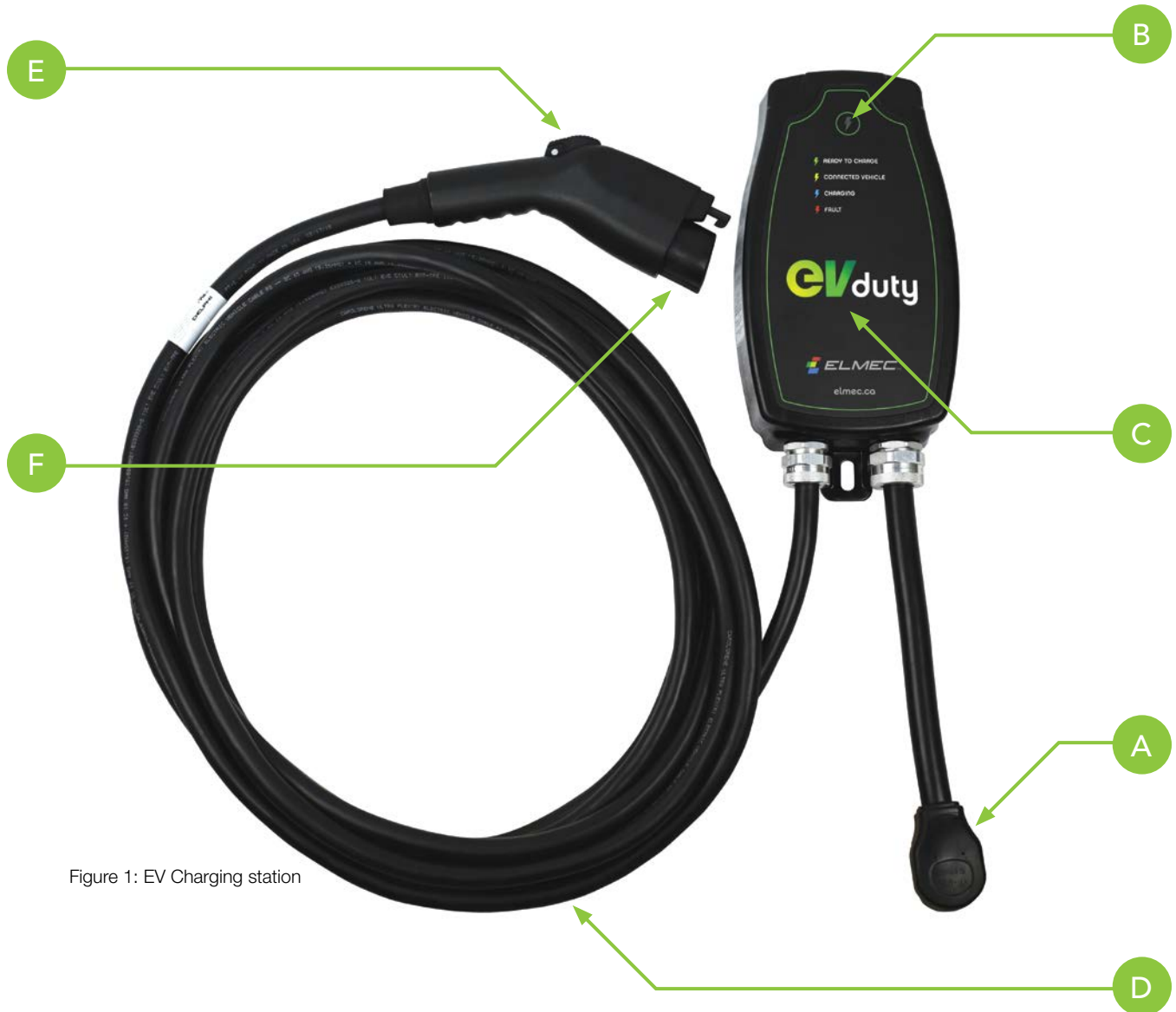
Figure 1: EV Charging station

The EVduty EVC30 series is a Level 2 Electric Vehicle Charging Station. Its primary function is to send electrical power to an Electrical Vehicle that is equipped with the SAE J1772 Electric Vehicle connector. Here are the main parts of the product